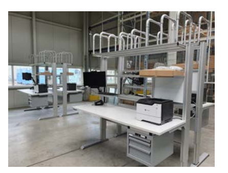
Oensingen distribution centre