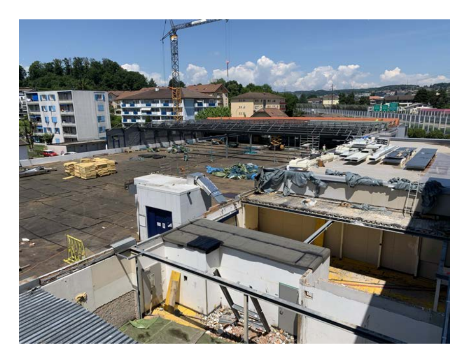
Construction site of the Galexis Lausanne-Ecublens distribution centre

The Galexis distribution centre in Niederbipp (Canton of Bern) is also being expanded and its capacity further increased with a focus on increasing its storage capacity for all product groups, but in particular for medication. The refurbishment and modernisation of the distribution centre in Lausanne-Ecublens proceeded according to plan in the reporting period.